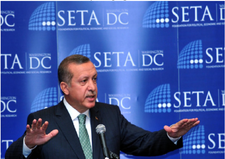
Turkish PM Recep Tayyip Erdogan speaking at the University Club

Erdogan was also frank in regard to Israel. “For the future of the world, the conflict between Israel and Palestine needs to be solved,” he said, and added that the ongoing embargo on Gaza had turned it into an open-air prison. Moreover, the conflict is a threat to international law that should not be overshadowed by personal interests. Unfortunately, he believes that as long as international leaders “are still discussing if we’re going to recognize a Palestinian state, our efforts are in vain.”