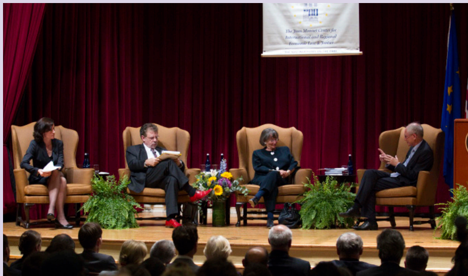
Herman van Rompuy, President of the European Council, at the NYU Law School