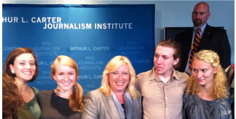
Slovakia Prime Minister Iveta Radičová posing with several NYU students at the Arthur L. Carter Journalism Institute

She outlined three major issues that, according to her, pinpoint why the crisis cannot be solved overnight. First of all, na-