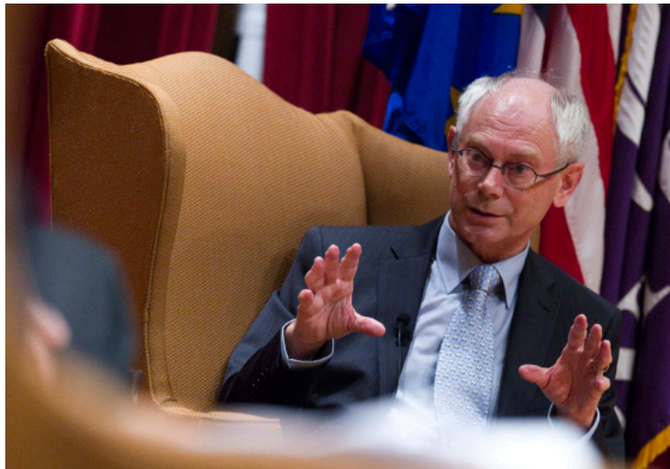
Herman van Rompuy, President of the European Council, at the NYU Law School

For the President of the European Council, there is no doubt that the EU is doing everything it can to deal with the ongoing crisis and that it continues to take steps in the right direction. "Greece defaulting is not an option because there is no alternative," van Rompuy concluded. "The only option is the one we have chosen: Greece has to put its house in order and we show solidarity."