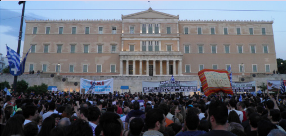
Greek protestors outside the Greek Parliament in Athens

“Are you also here to hear about how the Greek economy is going to fail?” a man asked as he got on to the elevator. Another woman turned to him and answered: “and ours!”