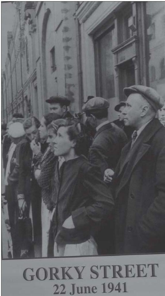
The poster that inspired Sir Rodric.

The 1941 Battle of Moscow is one of the lesser-known battles of the Second World War. It marked the reversal of the Wehrmacht's victorious eastward march. •