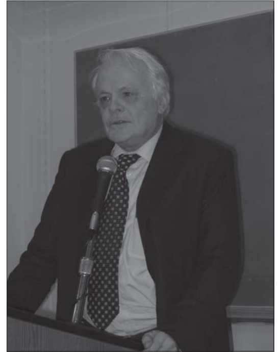
Sir Rodric Braithwaite, author of Moscow 1941: A City and Its People at War

Realistically, the victory could not be attributed solely to the city defenders' stoicism and courage, Braithwaite said. The Soviet leadership's ruthlessness and German miscalculations played a big role in determining the battle's outcome. Yet, the book